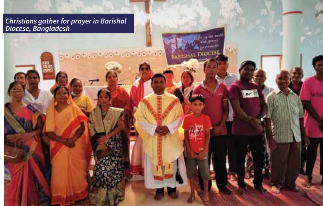
Christians gather for prayer in Barishal Diocese, Bangladesh