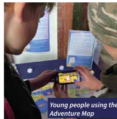
Young people using the Adventure Map