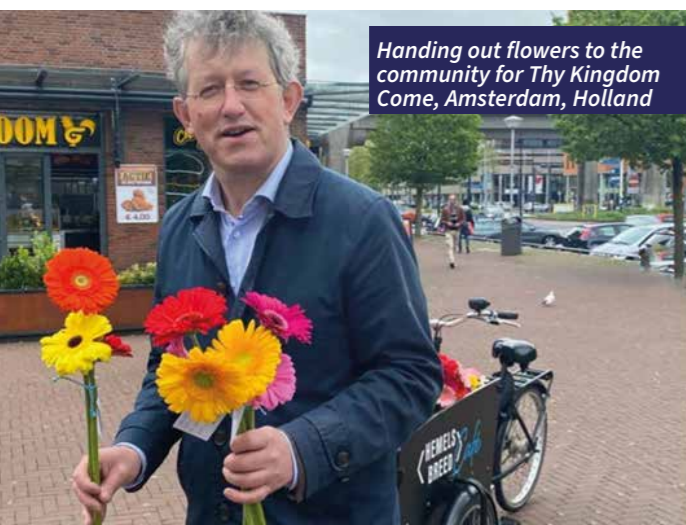
Handing out flowers to the community for Thy Kingdom Come, Amsterdam, Holland