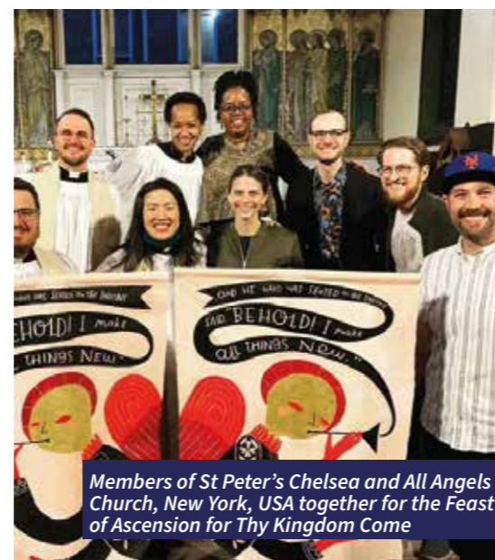
Members of St Peter's Chelsea and All Angels Church, New York, USA together for the Feast of Ascension for Thy Kingdom Come