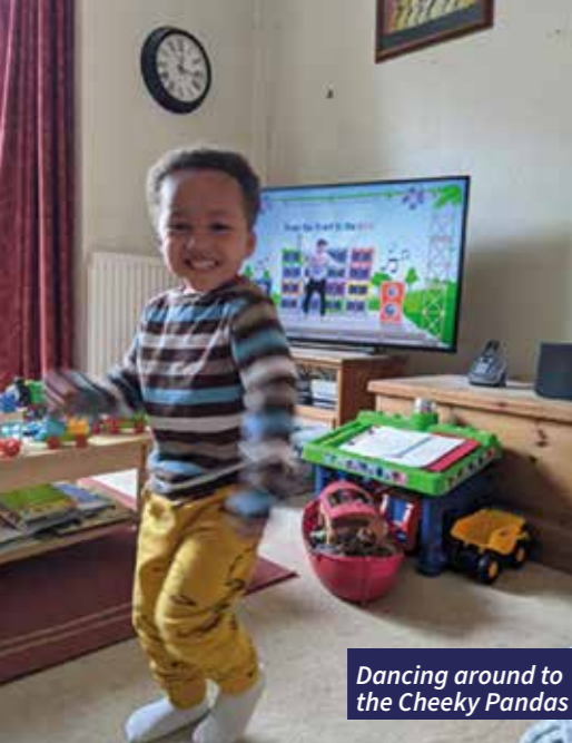
Dancing around to the Cheeky Pandas