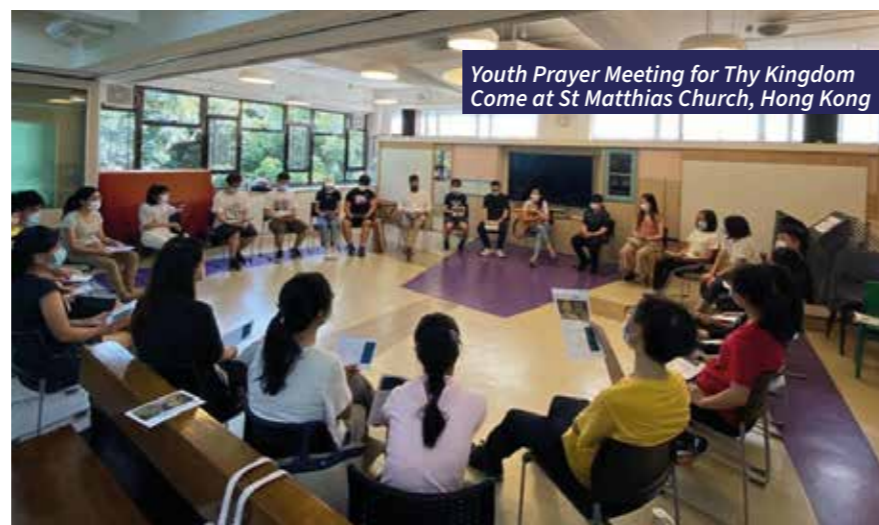
Youth Prayer Meeting for Thy Kingdom Come at St Matthias Church, Hong Kong

All these were constantly devoting themselves to prayer, together with certain women, including Mary the mother of Jesus, as well as his brothers.