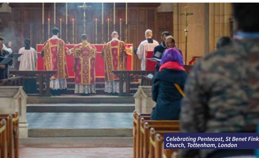
Celebrating Pentecost, St Benet Fink Church, Tottenham, London