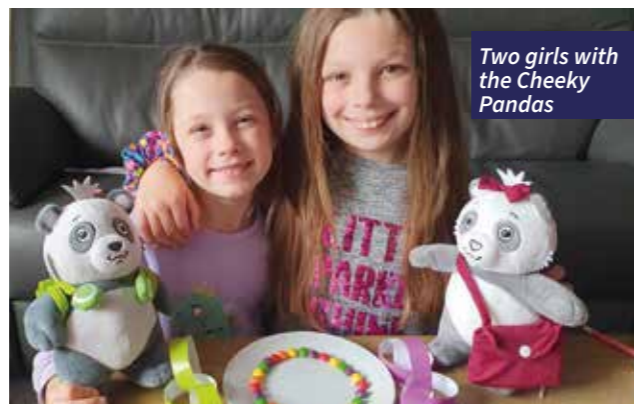
Two girls with the Cheeky Pandas