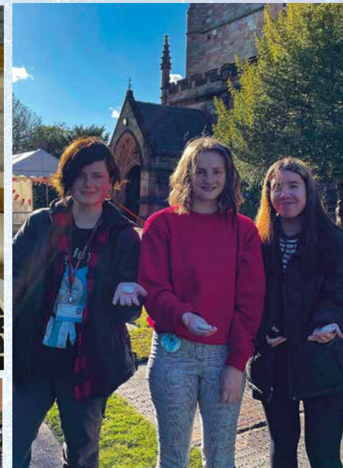
From continuous prayer on and offline to creative prayer stations, Bow Down prayer moments to prayer walking in the community, Christians around the world gathered to pray in a range of ways during the 11 days.